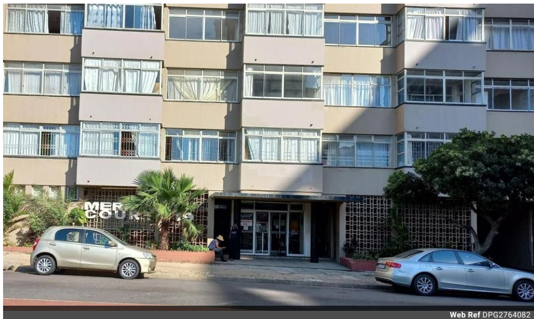
Web Ref DPG2764082