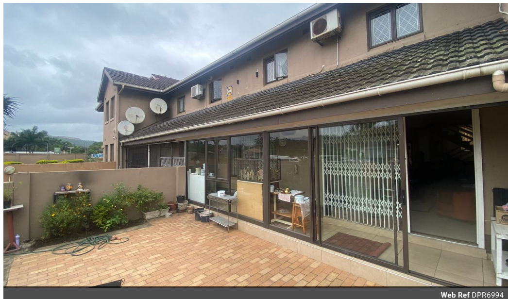
Web Ref DPR6994

558 Mountbatten Drive Reservoir Hills Durban 4090