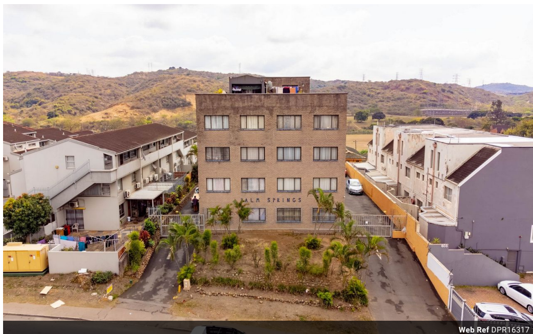
Web Ref DPR16317

Shop 1, Gordana Court, 22/26 Salisbury Avenue, Westville