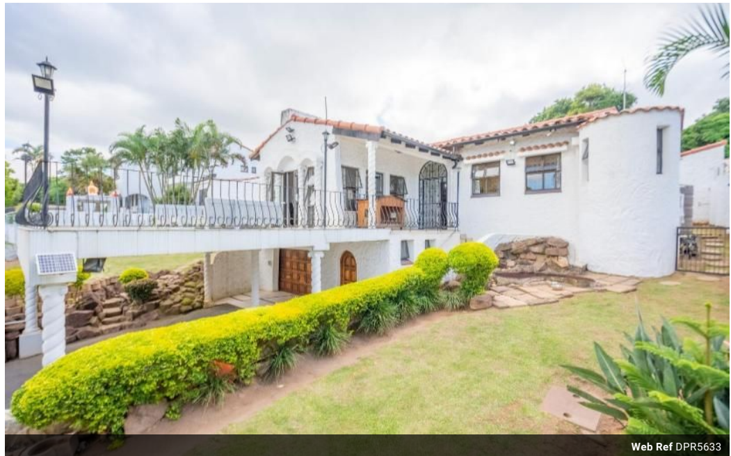
Web Ref DPR5633

558 Mountbatten Drive Reservoir Hills Durban 4090