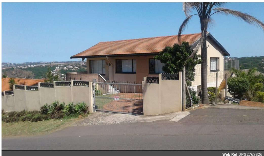
Web Ref DPG2763326

1 Knightbridge, 16 Westville Road, Westville