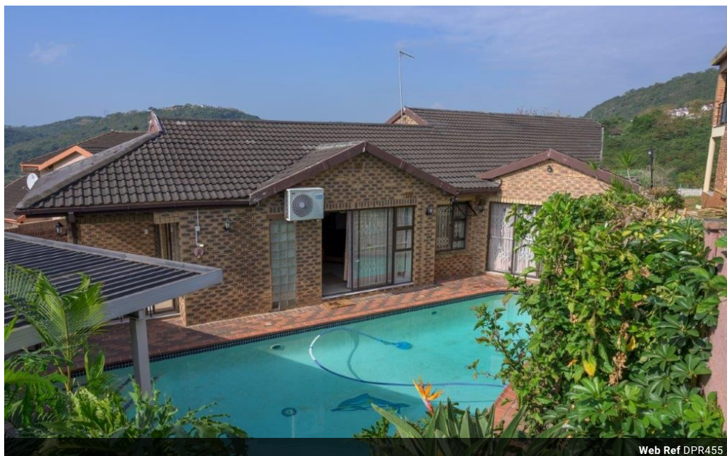
Web Ref DPR455

1 Knightbridge, 16 Westville Road, Westville