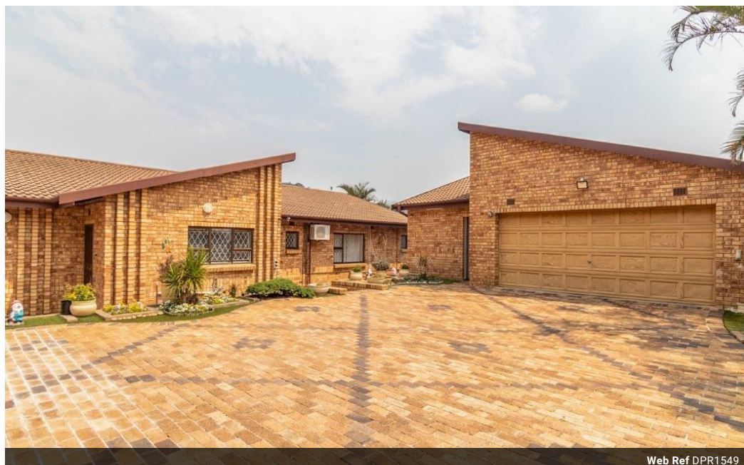
Web Ref DPR1549

1 Knightbridge, 16 Westville Road, Westville