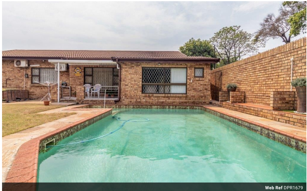
Web Ref DPR1679

Shop 1, Gordana Court, 22/26 Salisbury Avenue, Westville