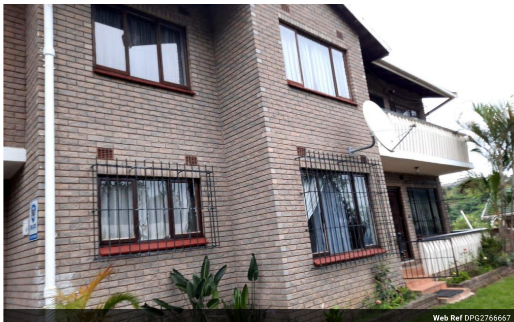
Web Ref DPG276667

558 Mountbatten Drive Reservoir Hills Durban 4090