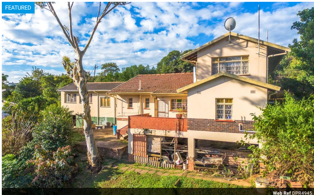
Web Ref DPR4945

Shop 1, Gordana Court, 22/26 Salisbury Avenue, Westville