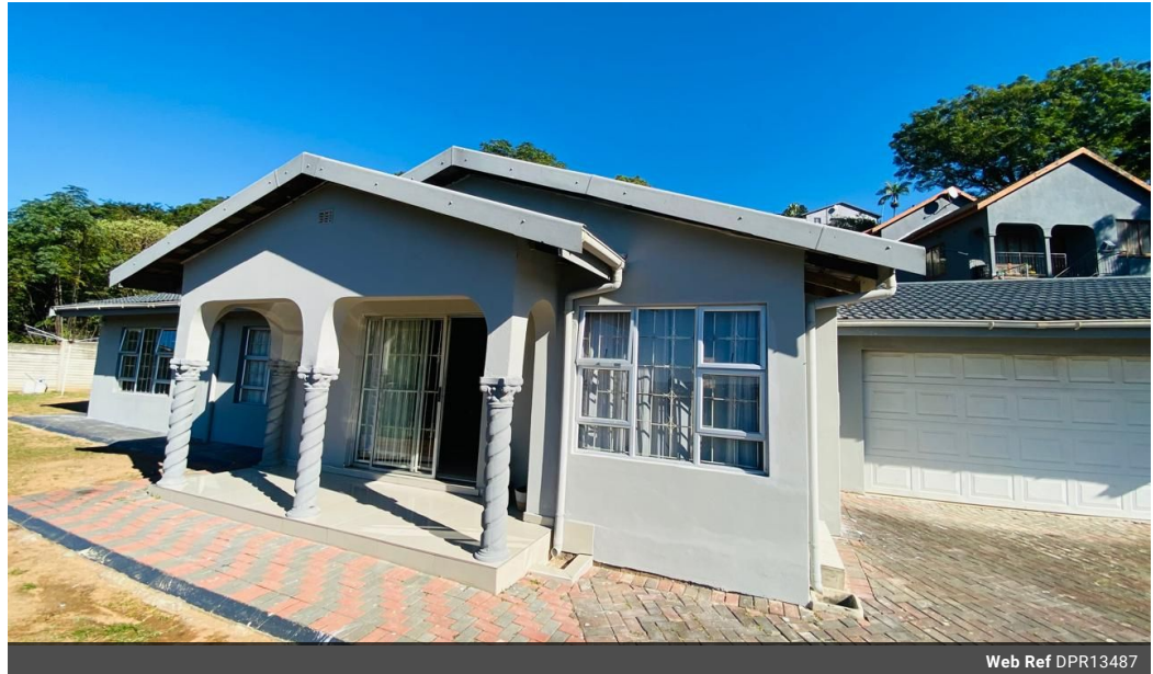
Web Ref DPR13487

558 Mountbatten Drive Reservoir Hills Durban 4090