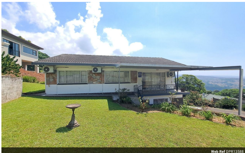
Web Ref DPR13588

Shop 1, Gordana Court, 22/26 Salisbury Avenue, Westville