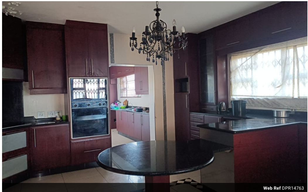
Web Ref DPR14763

558 Mountbatten Drive Reservoir Hills Durban 4090