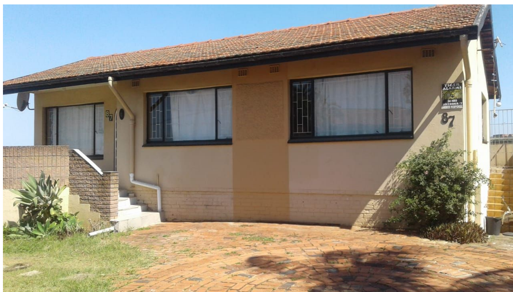
Web Ref DPR15703

1 Knightbridge, 16 Westville Road, Westville