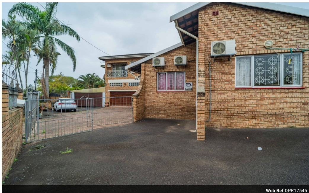
Web Ref DPR17545

Shop 1, Gordana Court, 22/26 Salisbury Avenue, Westville