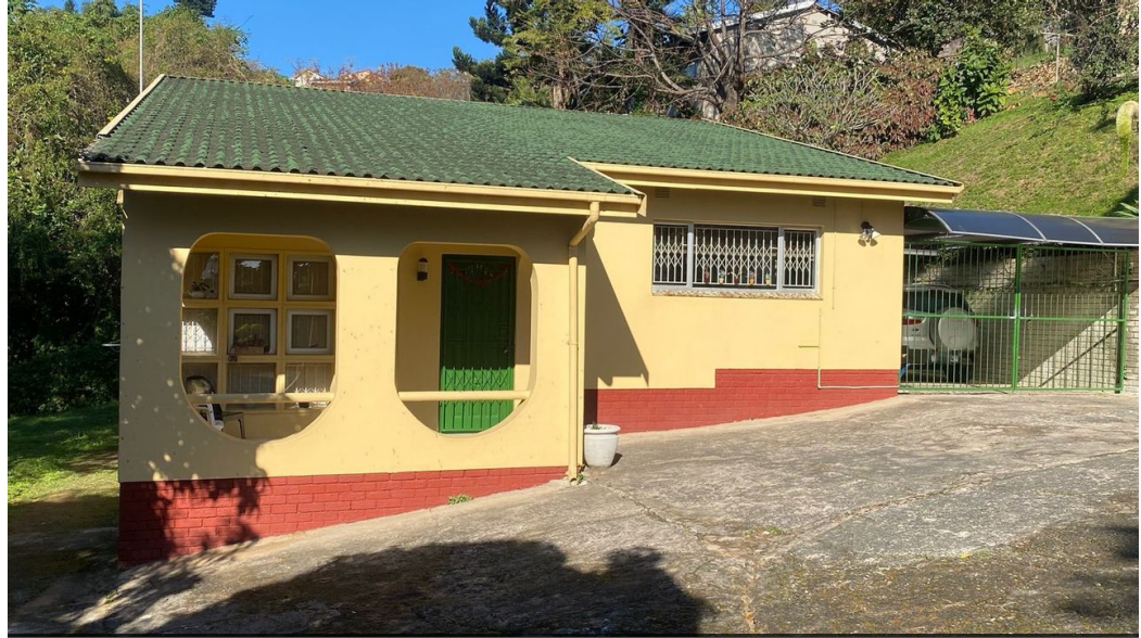
SOLE MANDATE, TENDER

558 Mountbatten Drive Reservoir Hills Durban 4090