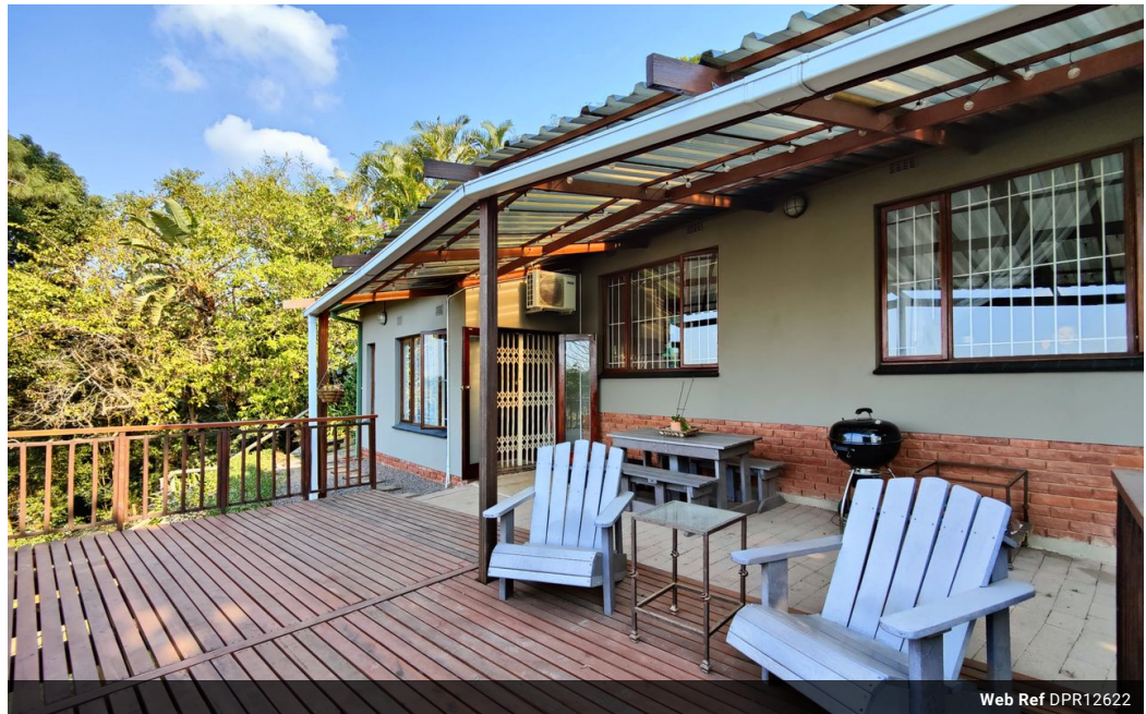
Web Ref DPR12622

1 Knightbridge, 16 Westville Road, Westville