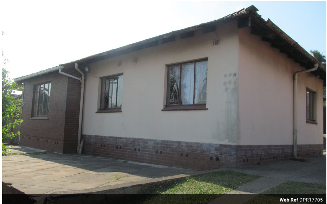
Web Ref DPR17705

Shop 2, 120 Stella Road Hillary Durban 4094