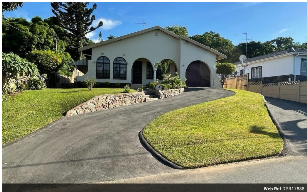
Web Ref DPR17888

Shop 2, 120 Stella Road Hillary Durban 4094