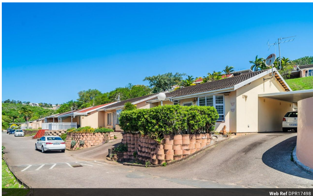
Web Ref DPR17498

Shop 1, Gordana Court, 22/26 Salisbury Avenue, Westville