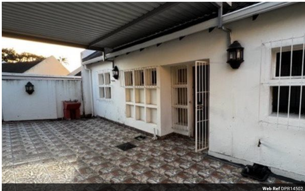
Web Ref DPR14502

1 Knightbridge, 16 Westville Road, Westville