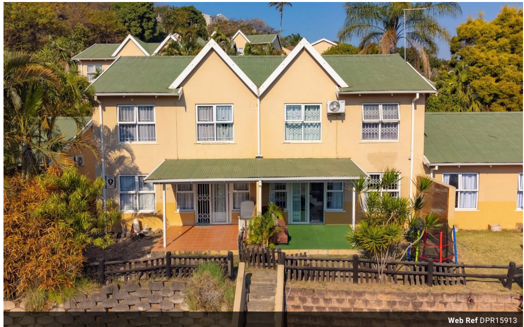
Web Ref DPR15913

Shop 1, Gordana Court, 22/26 Salisbury Avenue, Westville