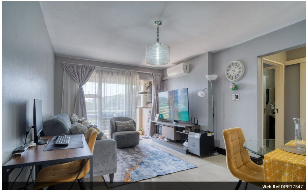
Web Ref DPR17547

Shop 1, Gordana Court, 22/26 Salisbury Avenue, Westville