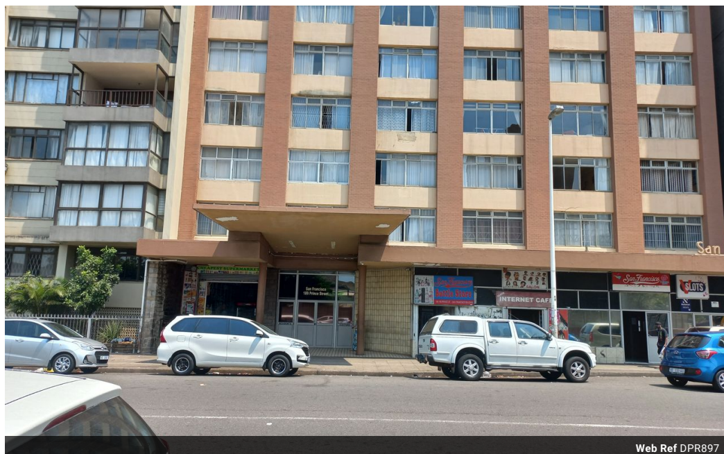
Web Ref DPR897