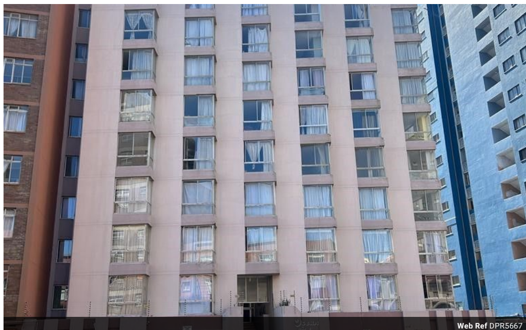
Web Ref DPR5667

558 Mountbatten Drive Reservoir Hills Durban 4090