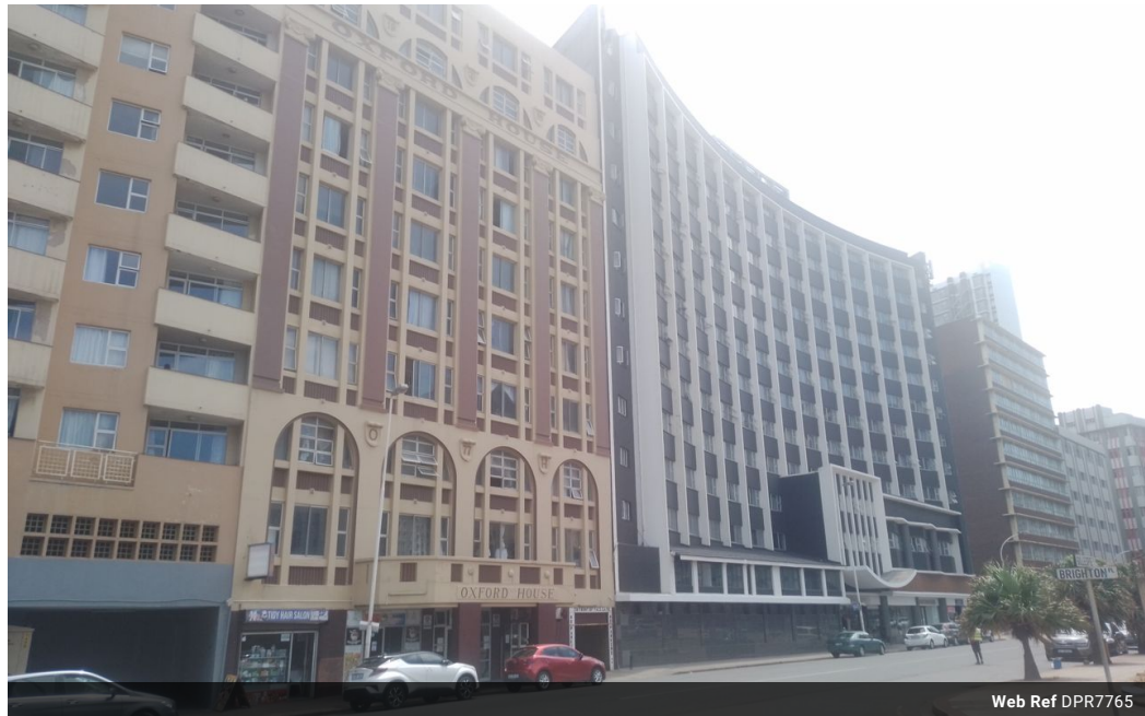
Web Ref DPR7765

3 Oslo Building 394 Ester Roberts Road Glenwood Durban 4001