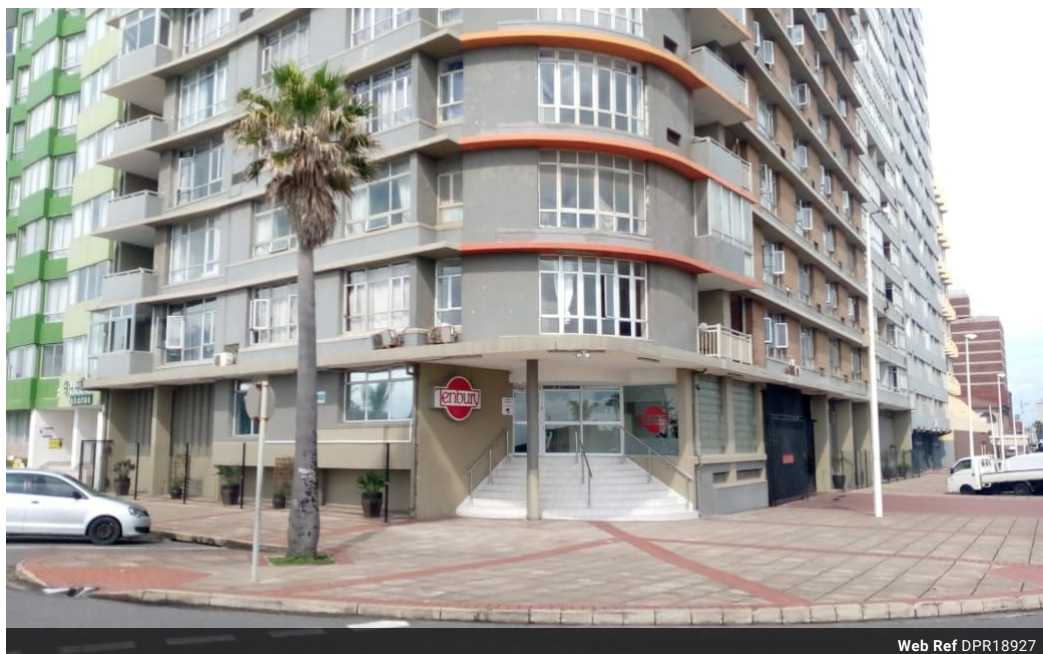
Web Ref DPR18927