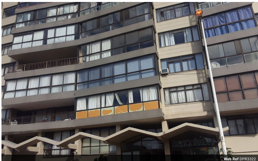
Web Ref DPR3322

3 Oslo Building 394 Ester Roberts Road Glenwood Durban 4001