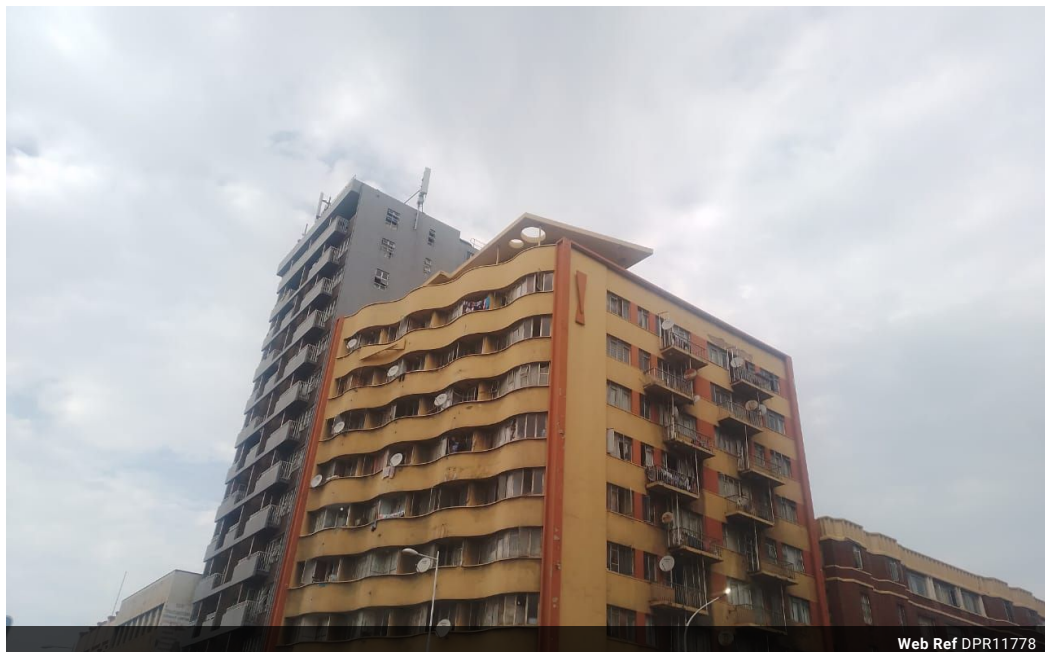
Web Ref DPR11778

3 Oslo Building 394 Ester Roberts Road Glenwood Durban 4001