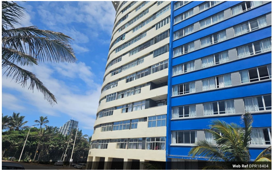
Web Ref DPR18404

558 Mountbatten Drive Reservoir Hills Durban 4090