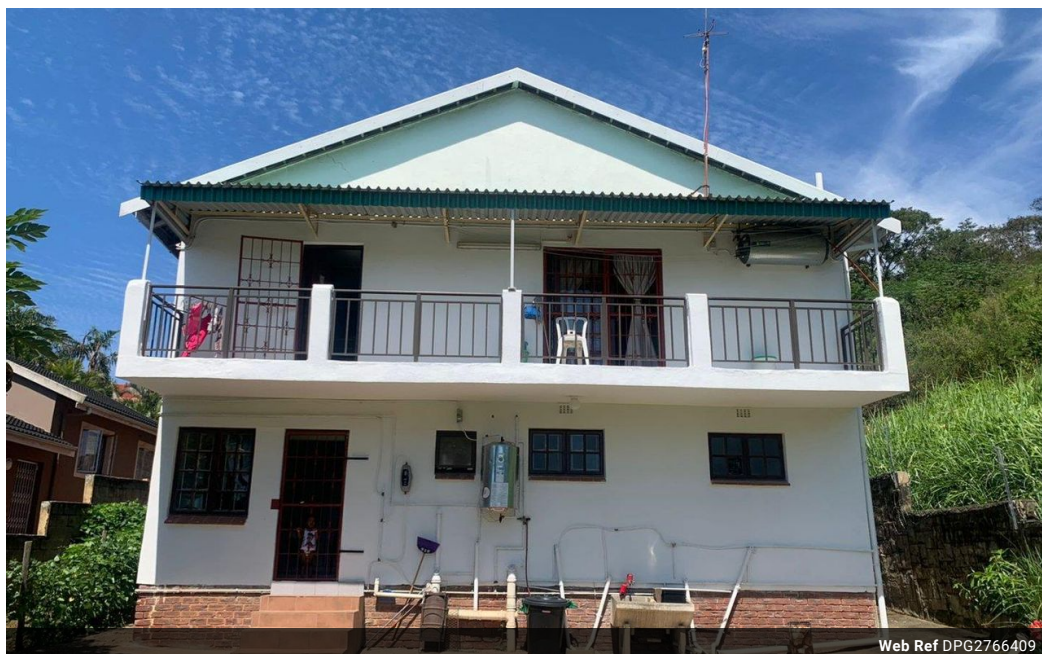
Web Ref DPG2766409

558 Mountbatten Drive Reservoir Hills Durban 4090