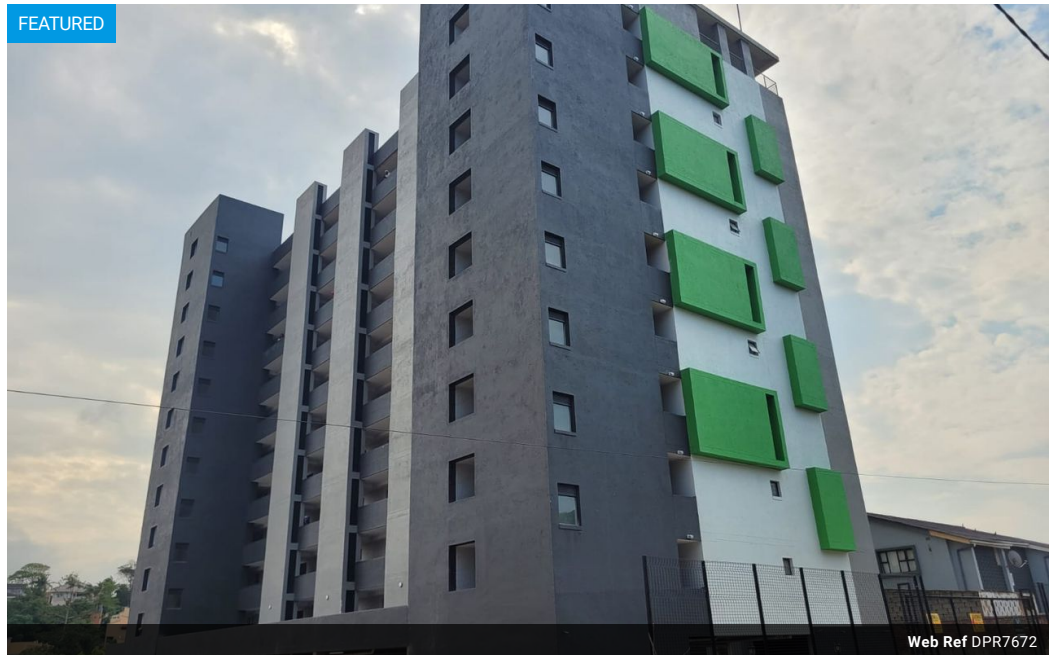
Web Ref DPR7672