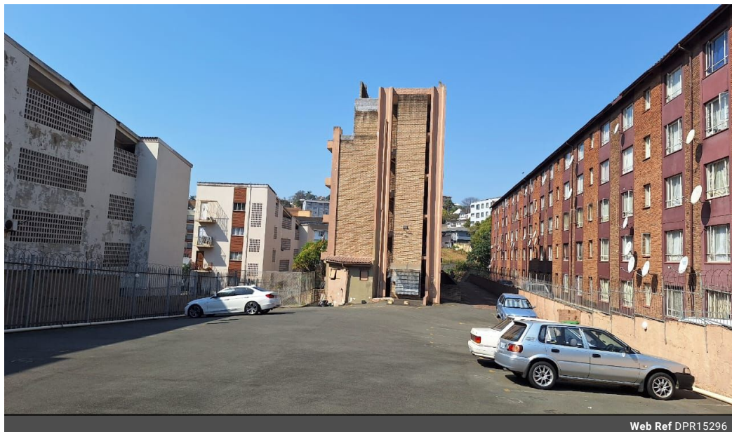
Web Ref DPR15296

558 Mountbatten Drive Reservoir Hills Durban 4090