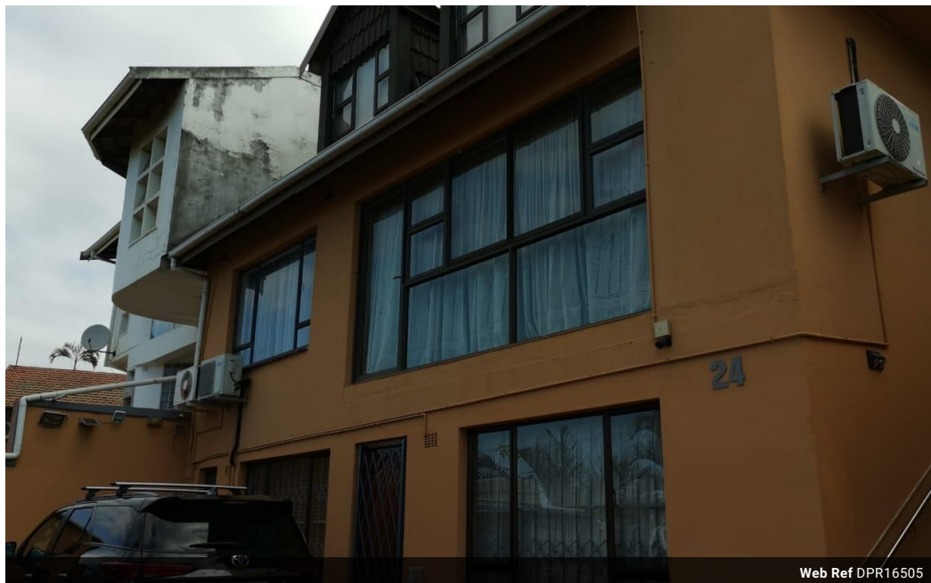
Web Ref DPR16505

3 Oslo Building 394 Ester Roberts Road Glenwood Durban 4001