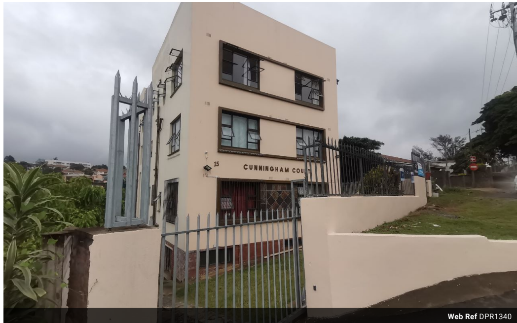
Web Ref DPR1340

3 Oslo Building 394 Ester Roberts Road Glenwood Durban 4001