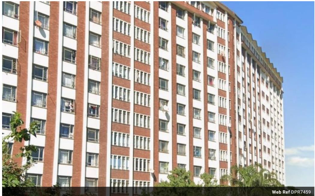
Web Ref DPR7459

3 Oslo Building 394 Ester Roberts Road Glenwood Durban 4001