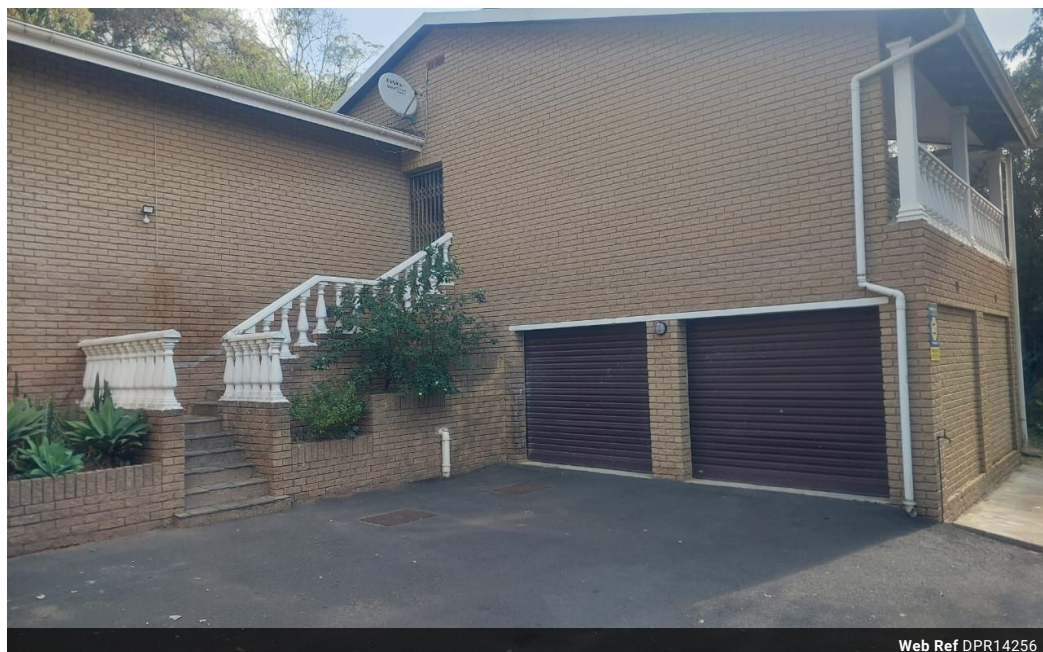
Web Ref DPR14256

1 Knightbridge, 16 Westville Road, Westville