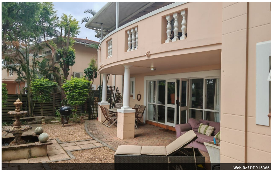
Web Ref DPR15366

1 Knightbridge, 16 Westville Road, Westville