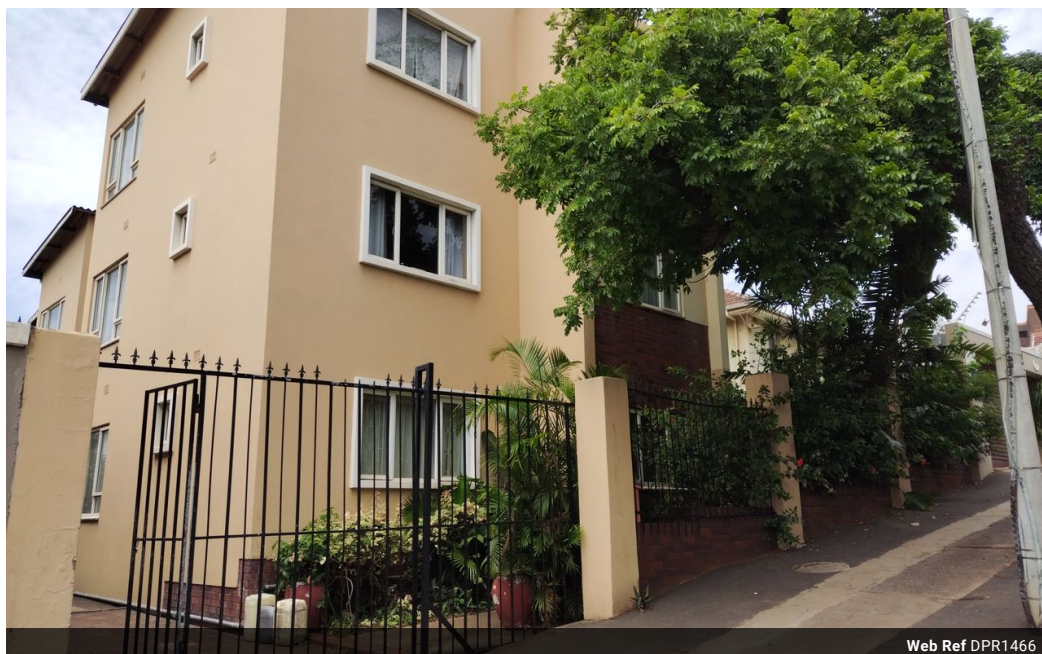
Web Ref DPR1466

3 Oslo Building 394 Ester Roberts Road Glenwood Durban 4001