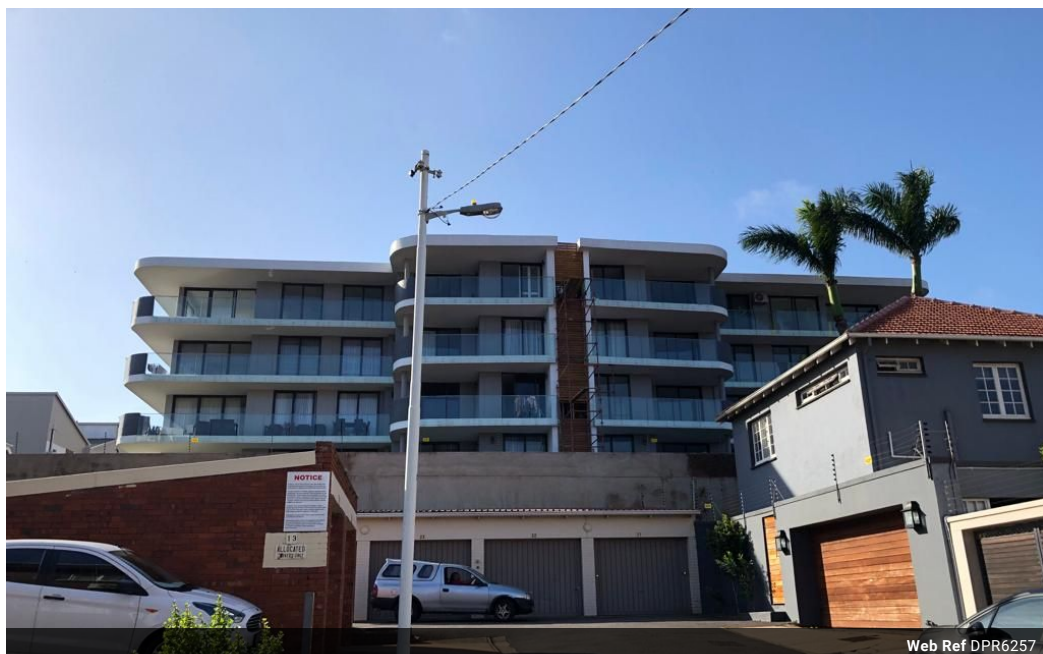
Web Ref DPR6257