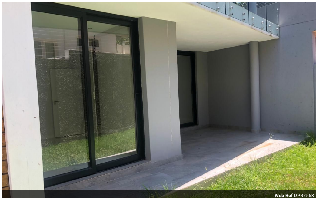
Web Ref DPR7568