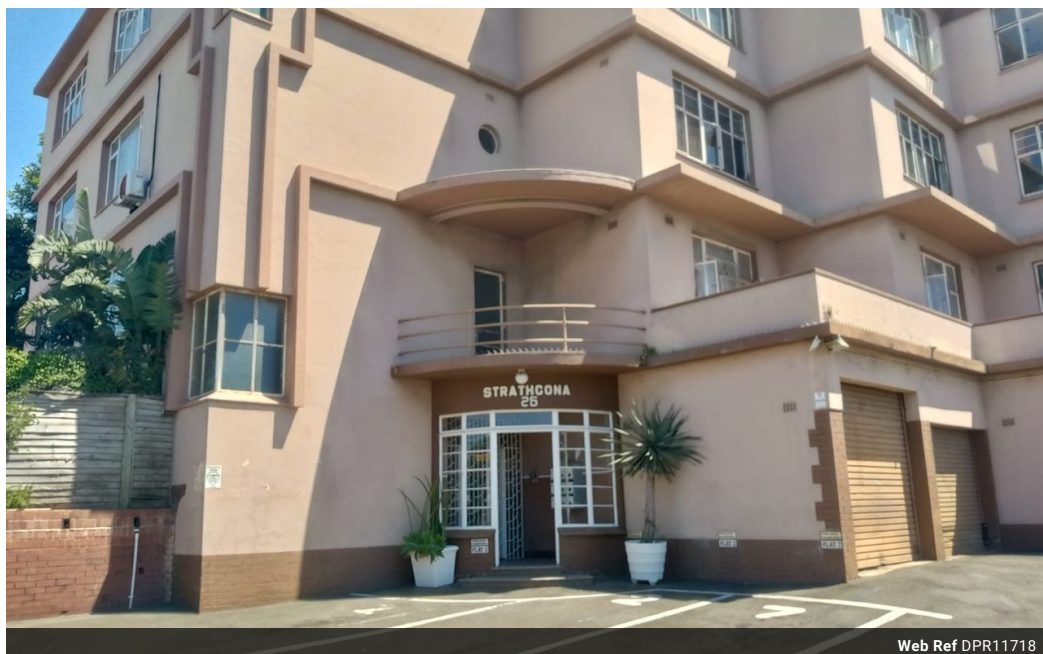
Web Ref DPR11718