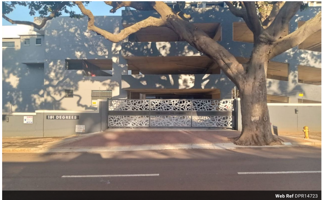
Web Ref DPR14723