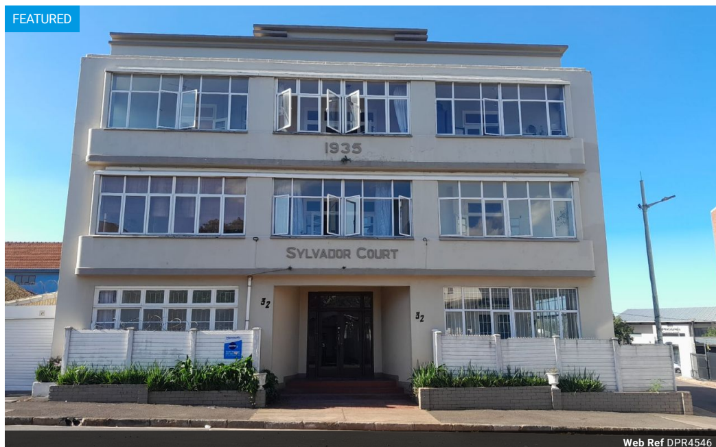
Web Ref DPR4546