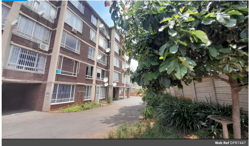
Web Ref DPR7447