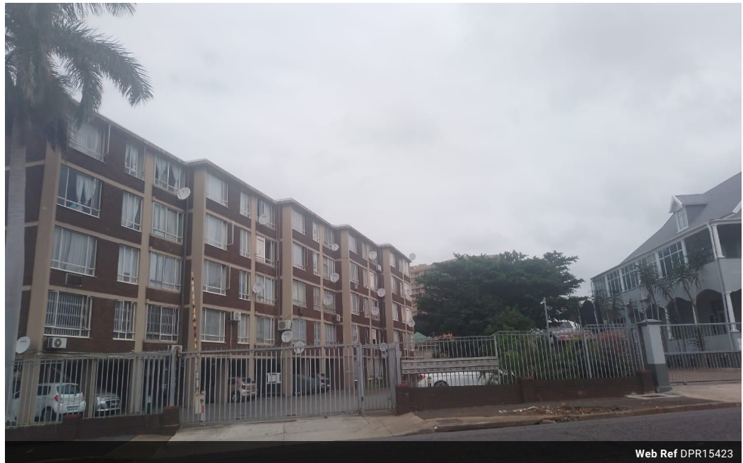
Web Ref DPR15423

3 Oslo Building 394 Ester Roberts Road Glenwood Durban 4001