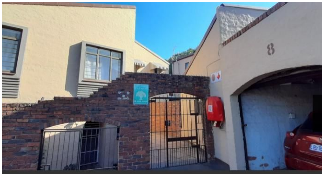
Web Ref DPR15472

558 Mountbatten Drive Reservoir Hills Durban 4090