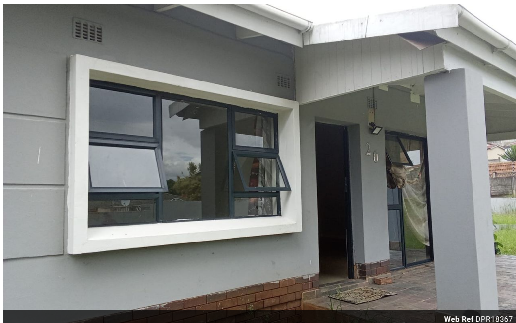
Web Ref DPR18367