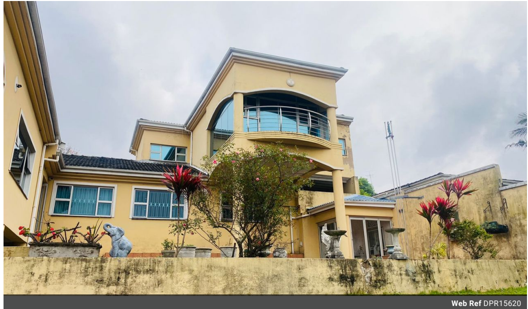
Web Ref DPR15620

558 Mountbatten Drive Reservoir Hills Durban 4090