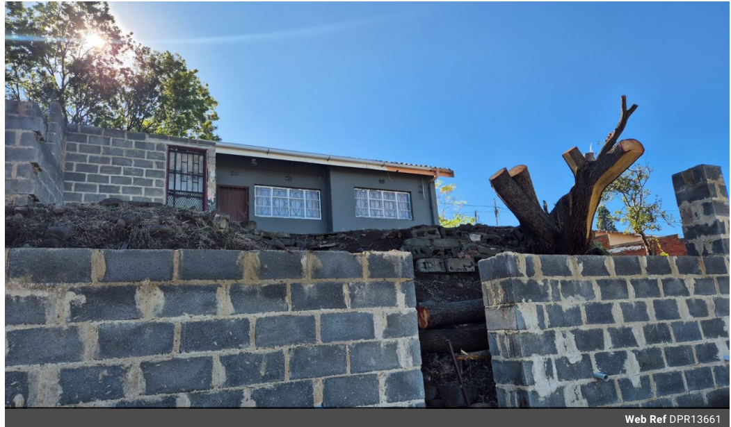
Web Ref DPR13661